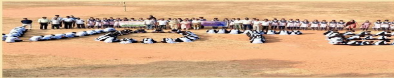
సోంపేట, చున లిక్కోలు